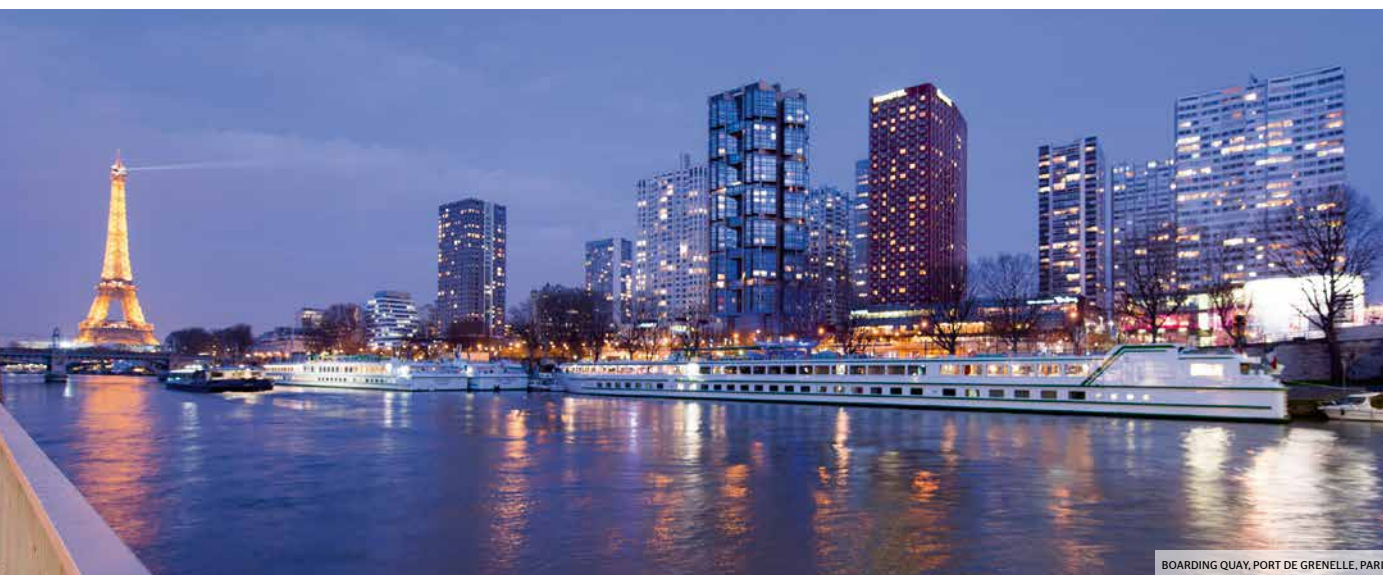
BOARDING QUAY, PORT DE GRENNELLE, PARIS